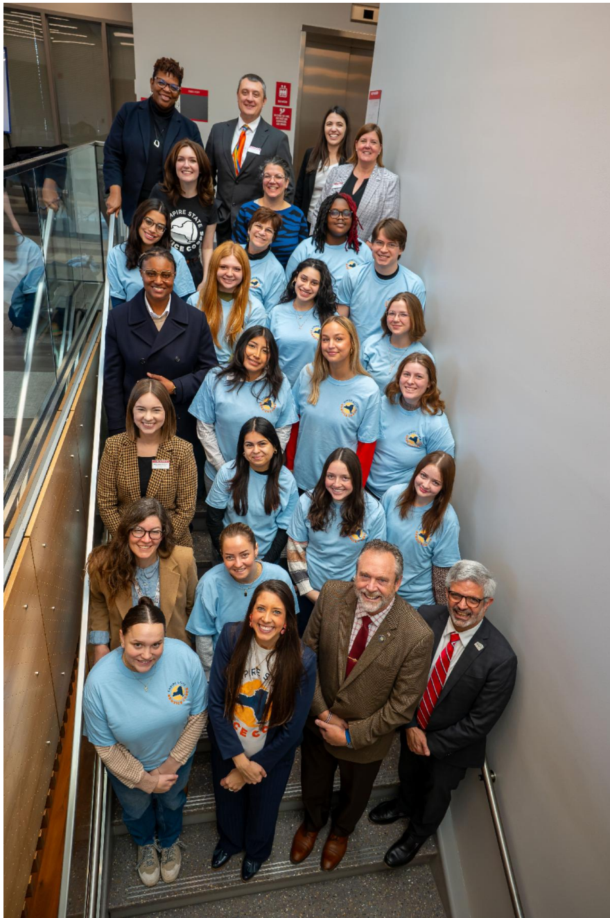
On November 21, the Office of Government Relations team visited the University at Albany with members of Senate and Assembly central staff to