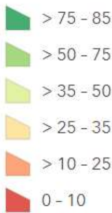
Percent FAFSA Completio