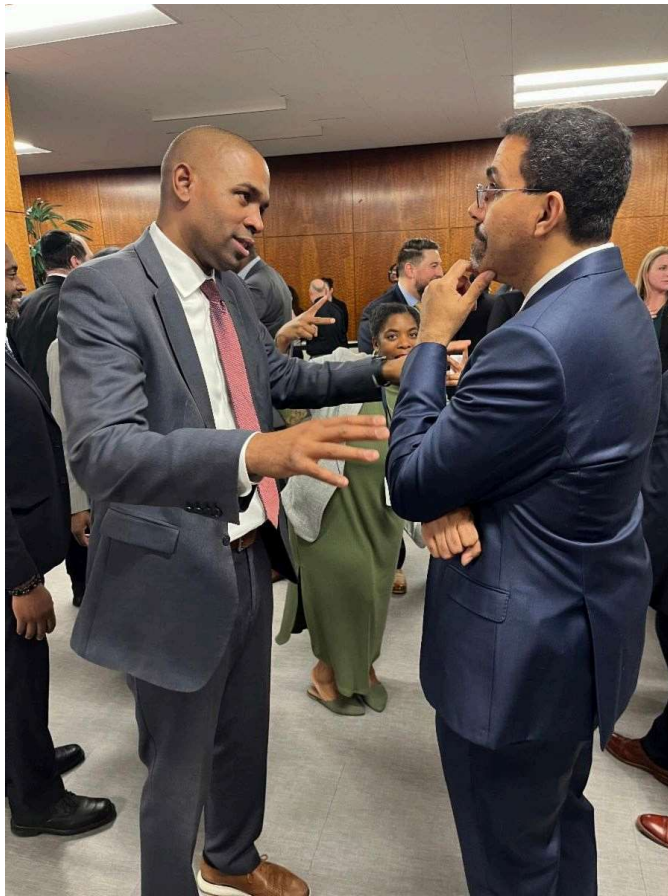
Chancellor King with Lieutenant Governor Antonio Delgado.