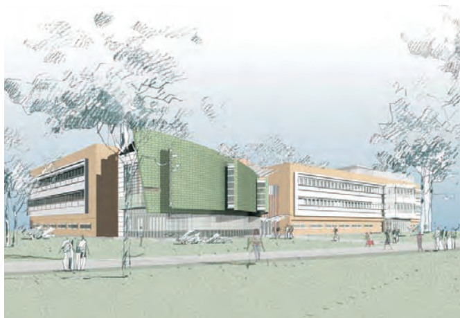
Center of Excellence at Stony Brook University

Established in 2005 with funding from the Finger Lakes Geriatric Education Center, the center provides faculty and student education through training, curricular enrichment, and outreach to social work providers and faculty in the surrounding region.