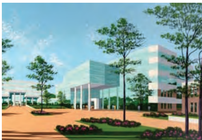
Center of Excellence at Stony Brook University