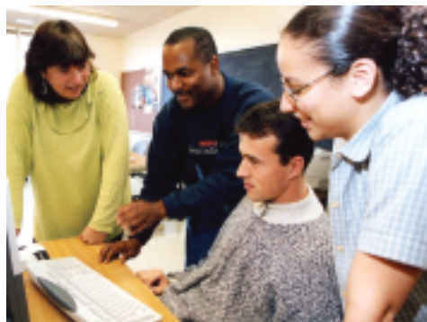
Rockland Community College

Unless otherwise noted, data is based on information from the State University of New York Office of Institutional Research and Analysis for academic year 2007-2008