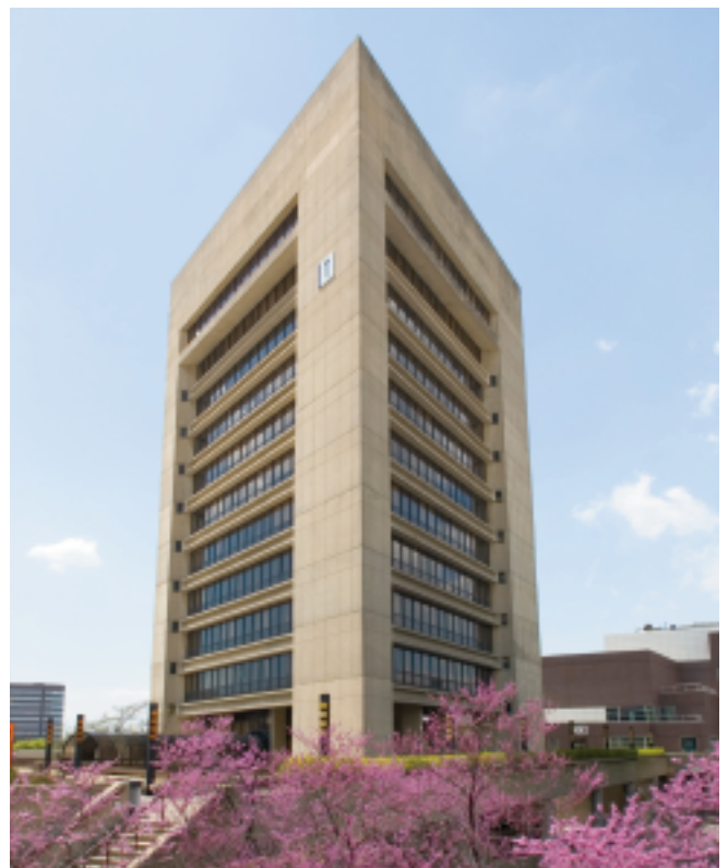
Nassau Community College